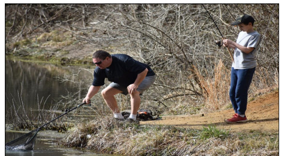
Photos shared by the Press Enterprise (above left), The Dominion Post (above center) the Times West Virginian (above right).